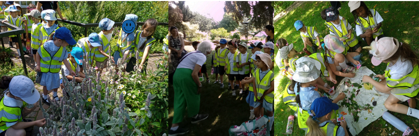
Year 1 visited Capel Manor on Monday as part of their topic - The Enchanted Woodland. Thank you to the parents who came along to help.

This week has been extremely hot but the children have managed remarkably well sharing our airconditioned spaces and not being able to play outside as they would usually. Thank you for your understanding about the postponement of the Sports Days this week. I know the changes are frustrating. Hopefully the weather will cooperate on the rearranged dates. We look forward to seeing you at the Key Stage 2 Sports Afternoon in Oakhil Park on Tuesday (we are aiming for a 1.35pm start). We will monitor the weather over the weekend and email to let you know if we will continue with a more relaxed approach to uniform next week.