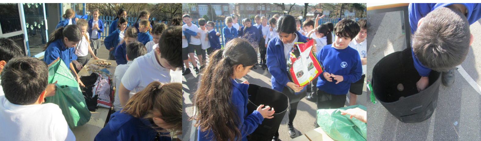
Year 5 have been learning about the planets and their properties. On Friday they had a talk from a Space Engineer. They have also been planting potatoes in preparation for their topic after Easter.