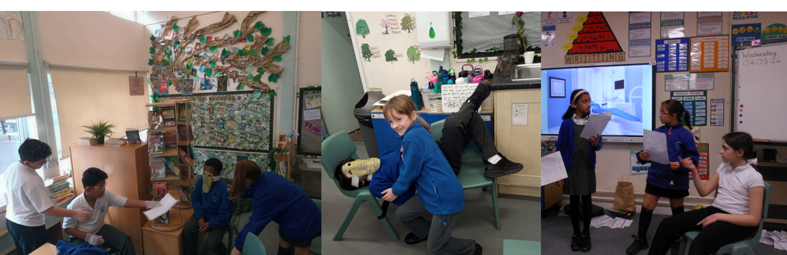
Year 4 have been reading, analysing and then performing the poem, The Dentist and the Crocodile by Roald Dahl.