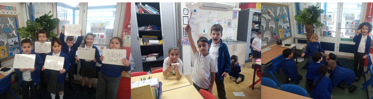
Year 2 have also been doing some drama based on the book that they are reading - Greta and the Giants .