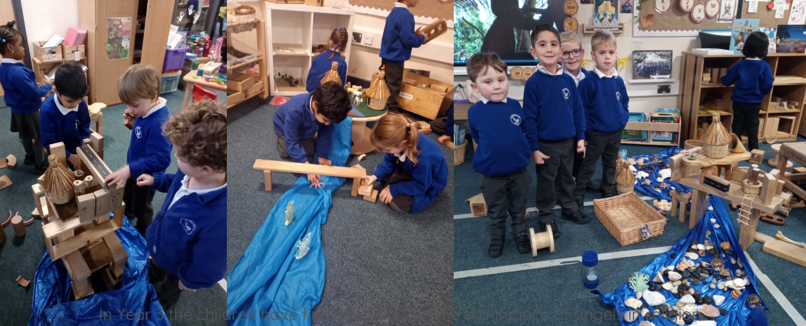
In Year 3 the children have finished their project on the significance of angels in religion.

After looking at homes in our local area, Reception has turned their attention to homes around the world. The construction and role play areas have been busy as you can see!